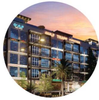
GULF TRADE CENTER