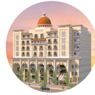
PEARL VISTA CLASSIC