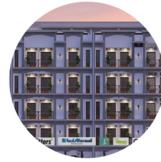
WIDE ZONE SQUARE