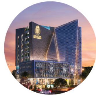
ACACIA MALL & RESIDENCY