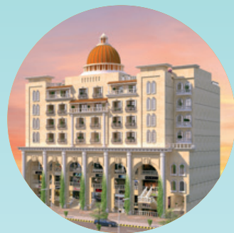
PEARL VISTA CLASSIC