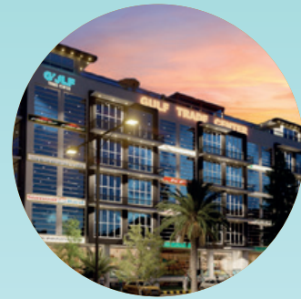
GULF TRADE CENTER