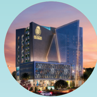
ACACIA MALL & RESIDENCY