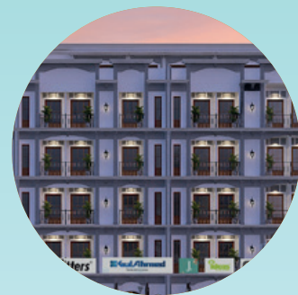
WIDE ZONE SQUARE