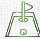
Mini Golf Club